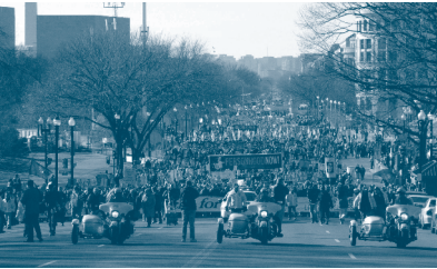
March for Life, Washington, DC

The Pro-life Movement is an extensive network of individuals, groups, and organizations that are working to save the unborn babies of America. Some of these entities are confronting abortion right at the clinics. Others are helping pregnant women to go through with their pregnancies. Certain groups are teaching women, men, and young