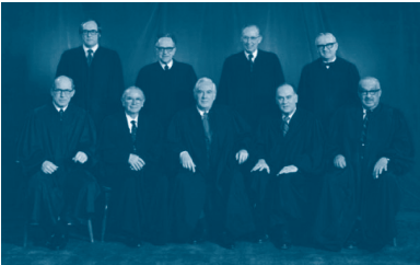
Roe v. Wade Court

The Roe vs. Wade decision divides the human gestation period into three trimesters of 13 weeks each. In the first trimester no law may be passed prohibiting a woman from obtaining an abortion. In the second trimester laws may be passed controlling how