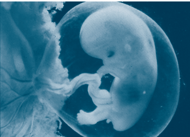
Unborn baby at 8 weeks

In this analysis, human life and its enemy abortion are defined, and the current state of abortion in America is summarized. The main bulwark of the defense against abortion, the Pro-life Movement, is carefully assessed. As a potential pro-life contingent, the