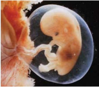
In America, this 8-week-old baby can be eliminated for about $300.

Because of legal abortion, "sanctity of life" is a thing of the past. Although the Declaration of Independence proclaims life as an "unalienable right," the unborn child has no defensible rights throughout all nine months of pregnancy.