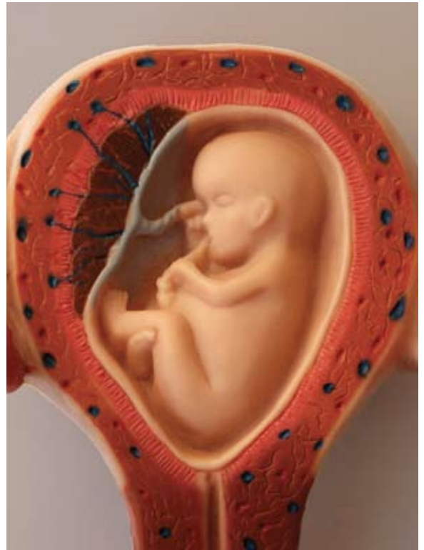
A perfect little 12-week-old human being is nestled in his mother's uterus. Actual size (model).

At 10-11 weeks the baby's body is completely formed, including the fingerprints he will take with him for the rest of his life. At 12-13 weeks no new organs or body systems form. Except for size and weight, the baby is essentially complete.