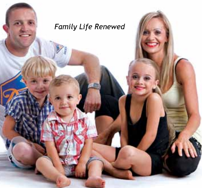
Family Life Renewed

The renewal of basic family life will have a profound affect on the entire country. Families make up communities, communities make up cities, cities make up states, and states make up the nation. Emotional and physical stability in the basic family will result in a country that reflects these qualities generally. When the Constitutional Amendment for Life is enacted, the long-range changes will begin to take place.