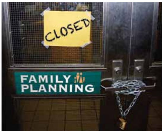
Closed for Good

Legal abortion, as the deliberate killing of unborn human beings, will be over forever in America. Also gone will be its drastic affects on parental lives and on social behavior. To appreciate this statement, one must realize that abortion is the most offensive and destructive evil ever to be legalized in America. In addition to the irreplaceable unborn lives, abortion has left innumerable women in a state of emotional crisis, from which they will never recover. But with the Amendment firmly in place, these emotional affects will disappear.