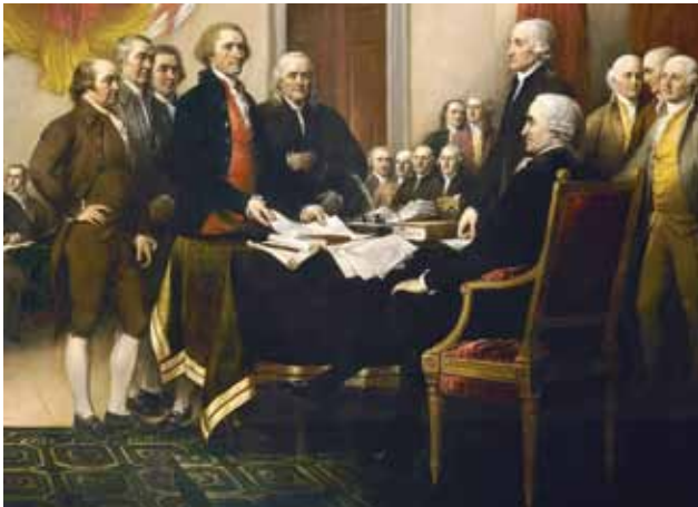
Drafting the Declaration of Independence

“all men are created equal, and are endowed by their Creator with certain unalienable rights, and among these is life.”