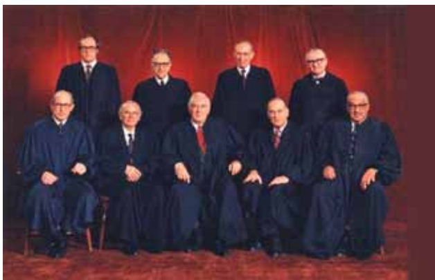
Justices of the Roe v. Wade Supreme Court

Since that time social conservatives have tried to overturn the Court’s decisions. Some laws have been passed at the state level, controlling when and how abortions may be done, but the effects have been limited. Despite everything