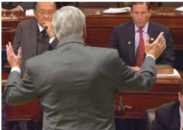
Introducing an Amendment

The essence of the Proclamation is recognizing the unborn human being as a person throughout pregnancy. When so recognized, existing Amendments 5 and 14 will protect the life of the unborn child. Amendment 5 says “No person shall be deprived of life without due process of the laws,” and Amendment 14 says “No state shall deprive any person of life without due process of the laws.” Crusade for Life’s proposed amendment offers the text