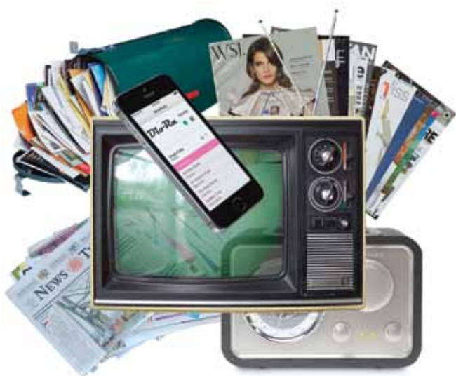
Reaching the Grassroots

Getting a two-thirds majority of the federal legislature to pass the Life Amendment is the first challenge to the Amendment program. In order to accomplish this, our entire nation must be made aware that an amendment is being sought. This information necessarily comes from America's media. This includes newspapers, magazines, radio, TV, and the internet media sources. This looks overwhelming, but it is possible by starting with a determination to succeed.