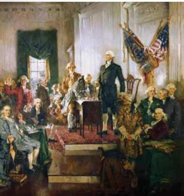
Signing of the U.S. Constitution

The Executive Branch consists of the president, the vice president, and a number of secretaries who have special areas of concern. The Legislative Branch is comprised of two bodies, or houses, namely the