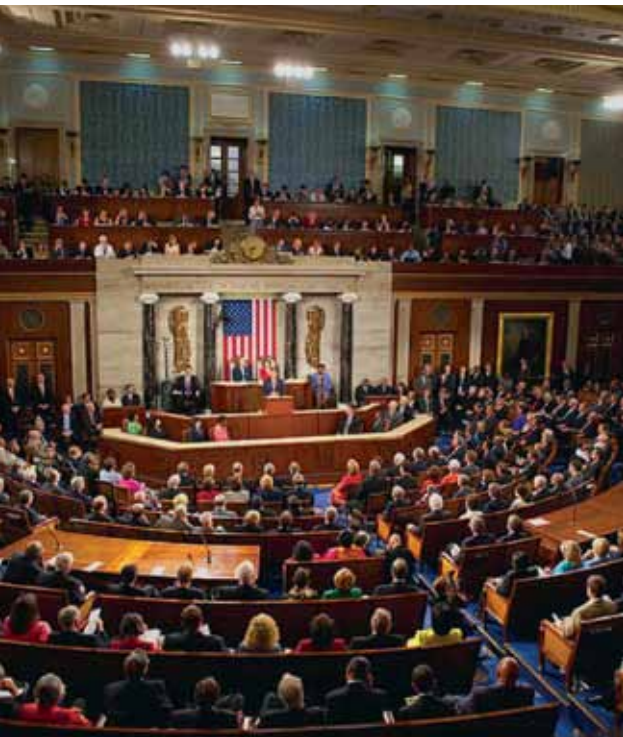
Joint Session of Congress

tures, or 38 states, must pass, or ratify, the amendment by a simple majority vote. At this point, the proposed amendment becomes an official part of the Constitution.